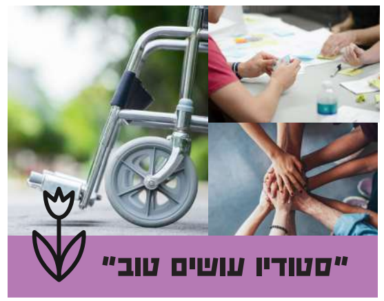
"סטודיו עושים טוב"